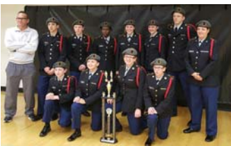
Junior ROTC cadets