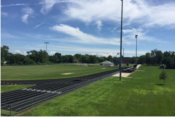
Danville High School Track and Field Complex