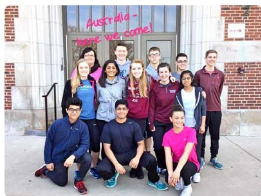
Future Problem Solvers Club on their way to Sydney, Australia—awarded 2nd at International FPS competition.