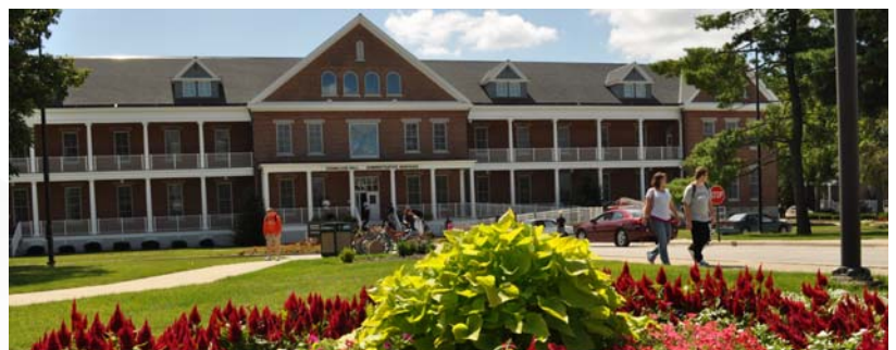
Danville High School is a strong community partner with Danville Area Community College.