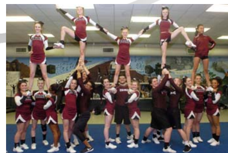
DHS Varsity Cheerleading Squad compete at IHSA State Cheerleading Finals