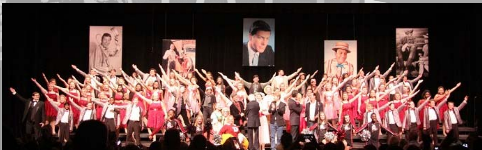
STUDENTS SHARE STAGE AT DANVILLE HIGH SCHOOL WITH ALUMNI DICK VAN DYKE—JUNE, 2016