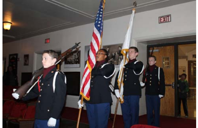
Junior ROTC students at Honors Night